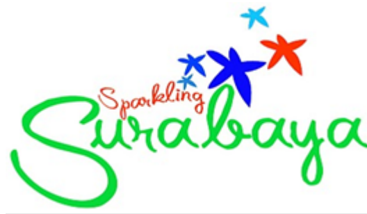
Logo Sparkling Surabaya

Marketing a city branding policy, a city is not only imaged through the process of strengthening infrastructure but also that city branding must be communicated to the community, both local people as "hosts" of migrants and visitors to the city of Surabaya, and in communicating them to the community, it is necessary to understand several concepts communication of a product to the community (Bungin, 2015: 76). In terms of public policy, borrowing the theory of the four factors that play a role in the implementation of a policy, according to Edward III (in Subarsono, 2006) communication, disposition, bureaucratic structure and resources are important collaborations for a policy. Without good communication between policymakers and policy implementers, public policy will not be able to run properly, ineffective, or even fail. This means that communication conveys a policy in the form of branding needs to be evaluated continuously. So it is interesting to study further about the performance of the implementation of City Branding Policy "Sparkling Surabaya" which could be increasingly forgotten by the people of Surabaya. As a basic argumentation building it is known that theoretically, an evaluation of public policy can be carried out as long as the policy is still carried out.).